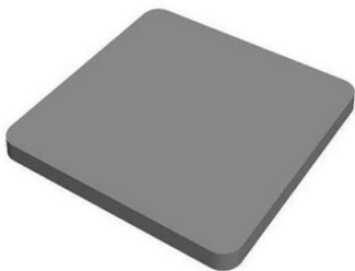
Packing Leveling Shim